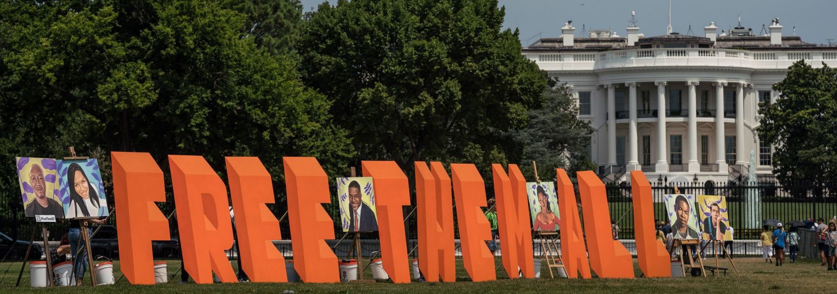
Detention Watch Network staged an artistic protest outside the White House on July 22, 2021, displaying portraits of migrants by artist Angelica Frausto.